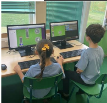
Year 2 are enjoying their new topic in computing based on coding. The children had to write codes and complete a number of tasks.