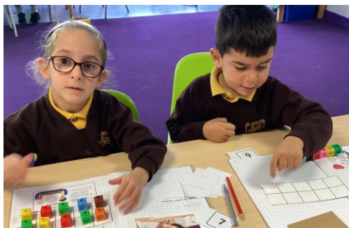
In Year 1 they have been practising counting backwards from 10-0 using tens frames and unifix cubes. As you can see, they are working really hard. Well done, Year 1.