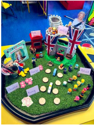
In Foundation 2, the children reflected on this moment in history and celebrated Her Majesty`s life.