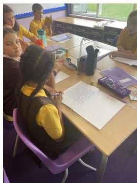
Year 5 have started looking at a new text called `Sir Gawain and the Green Knight`. Here they are writing their own Myths. Great start Year 5! Well done.